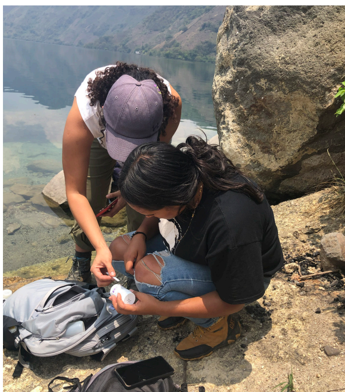
Testing water pH at Lago Ayarza

Despite the limitations in available information, the experts' evaluation found an increase in the concentration of arsenic, magnesium, lead, and selenium in surface water downstream from the mine. They also identified an increase in aluminum, arsenic, iron, and selenium in groundwater below the tailings dam. They noted the presence, albeit below permissible levels, of metals such as strontium, which are not naturally available in the environment. While the concentrations are still within allowable limits, they raise concern about how the mine