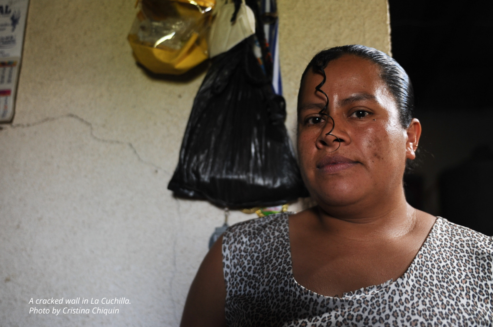
A cracked wall in La Cuchilla.

and even the church began within a year after the mine went into operation. In response to a request from the company that owned the mine at the time, the National Coordinator for Disaster Reduction (CONRED) undertook a risk assessment and declared the area uninhabitable in 2016, but did not hold the mine responsible. The value of land in the community plummeted, as a result of which people lost needed access to credit, as well as public services, basic provisions and their church was closed, affecting an estimated 21 families. The municipality negotiated with the company to build some homes for the displaced families in the centre of San Rafael Las Flores, but they were considered culturally inappropriate for the community members' needs, due to lack of space for a large family and sufficient land on which to plant trees, plants, or to keep animals. 5