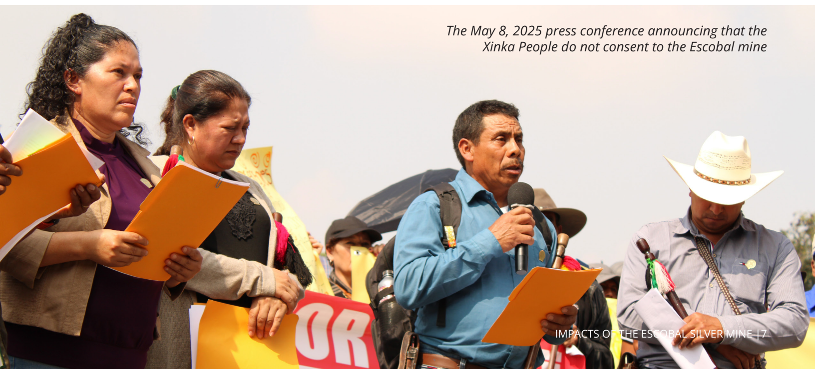
The May 8, 2025 press conference announcing that the Xinka People do not consent to the Escobal mine