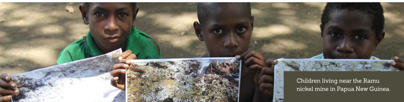
Children living near the Ramu nickel mine in Papua New Guinea.

1612 K Street NW, Suite 904 Washington, D.C. 20006 202.887.1872 • earthworks.org