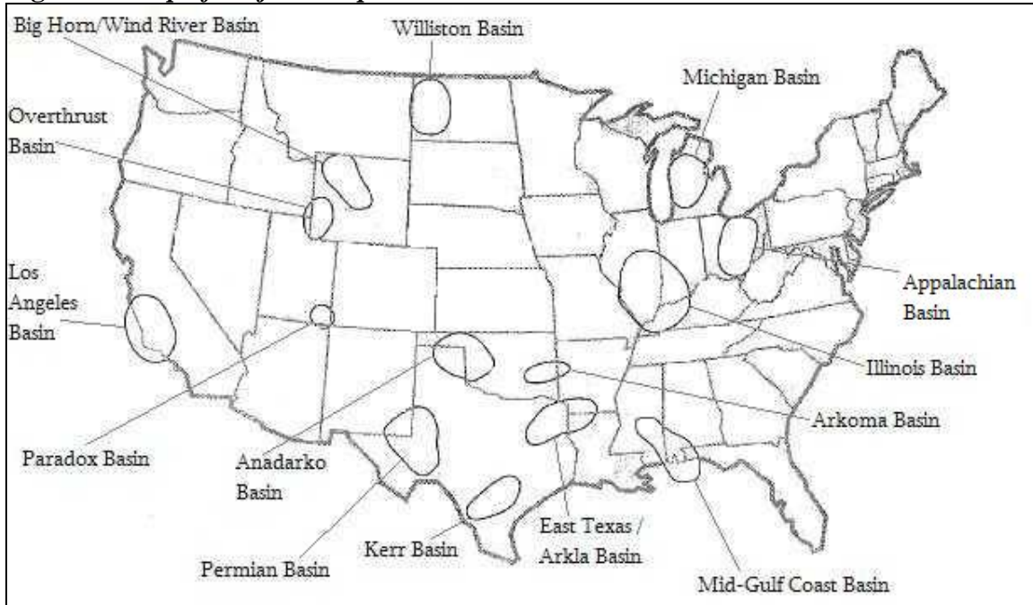
Figure 1. Map of Major H 2 S-prone Areas in the Continental United States 18

The most comprehensive source on the distribution of sour gas is a report prepared by consultants for the Gas Technology Institute, formerly Gas Research Institute, a research, development, and training organization that serves the natural gas industry. 16 This report states that “Regions with the largest percentage of proven reserves with at least 4 ppm hydrogen sulfide are Eastern Gulf of Mexico (89 percent), Overthrust (77 percent), and Permian Basin (46 percent).” 17 Figure 1 illustrates the major H 2 S prone areas in the United States and identifies the basins.