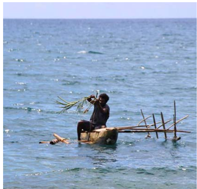
IMAGE: Grassroots resistance to deep sea mining. A New Irelander puts up a "gorgor" near the Solwara 1 site in the Bismarck Sea of Papua New Guinea to prohibit the entry of Nautilus Inc. According to customary law New Irelanders have the right to destroy vessels entering their waters without permission.

Contrary to EE's conviction that the project will have no cultural impacts, local communities have used traditional practices to ban the entry of Nautilus from the ocean surrounding the Solwara 1 site.