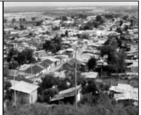
Town of Tambogrande votes NO to Gold Mine.

Community organizing to stop a proposed gold mine in Tambogrande, a town in