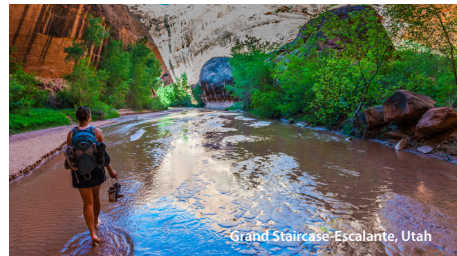
Grand Staircase-Escalante, Utah

Grand Staircase Escalante's unique biological and cultural resources include landscapes spanning five life zones and remains of a history dating back to 950 AD. Areas of this former national monument, including its monoliths, slot canyons, natural bridges, and arches are now being threatened by copper and silver mining. Grand Staircase-Escalante, previously protected, and now only 15% of its original size, has become open to mining for the first time in 21 years. 1