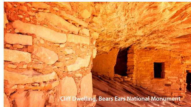
Cliff Dwelling, Bears Ears National Monument

The Bears Ears National Monument was protected at the request of a Native American coalition of Navajo, Hopi, Zuni and Ute tribes. When the President removed protections for 83% of the Monument's area in December 2017, mining interests immediately began reviving uranium mining claims under the 1872 Mining Law.