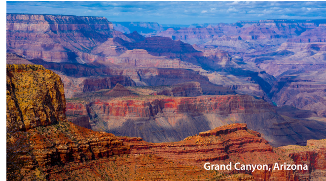
Grand Canyon, Arizona

One of the world's Natural Wonders, Grand Canyon National Park stretches over 1,902 square miles, encompassing an extensive system of colorful tributary canyons cut through by the Colorado River. With over five million visitors each year, the spectacular views, electrifying rapids and challenging hikes make for a recreationist's dream and a source of national pride. The Canyon also offers great opportunities for bird watching, wildlife viewing and fishing. Both the north and south rims of the Grand Canyon have been threatened by uranium mining in the past and many abandoned mining claims dot the landscape. Despite a temporary hold on mining, increased interest in uranium could mean new claims around the Canyon in the near future.