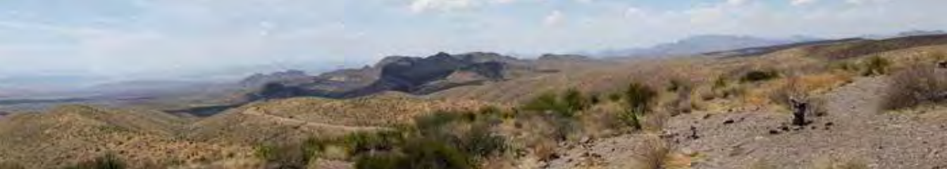
ABOVE: Sotol Vista Overlook, Big Bend National Park, Texas. COVER: Davis Mountains State Park, Texas.